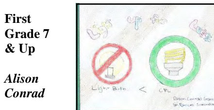
First Grade 7 & Up