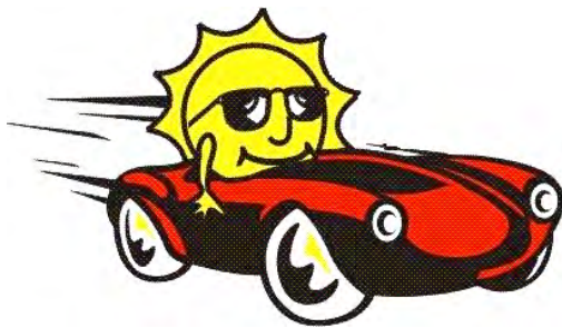
Our new logo

Lots of photos of the event can be found on the Web Site! We are seeking a new coordinator for this event for 2006!