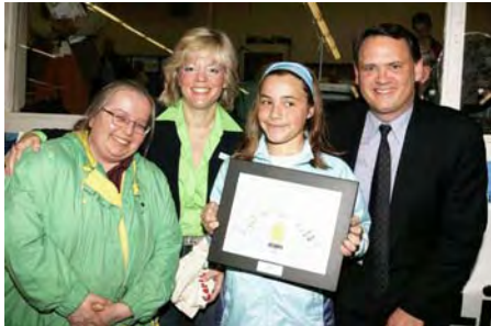
Student receiving award at EcoFair