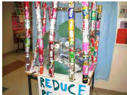
The Winners - Greely Elementary

This contest is due for an overhaul, and will morph into something new for 2006. Keep watching for new details!